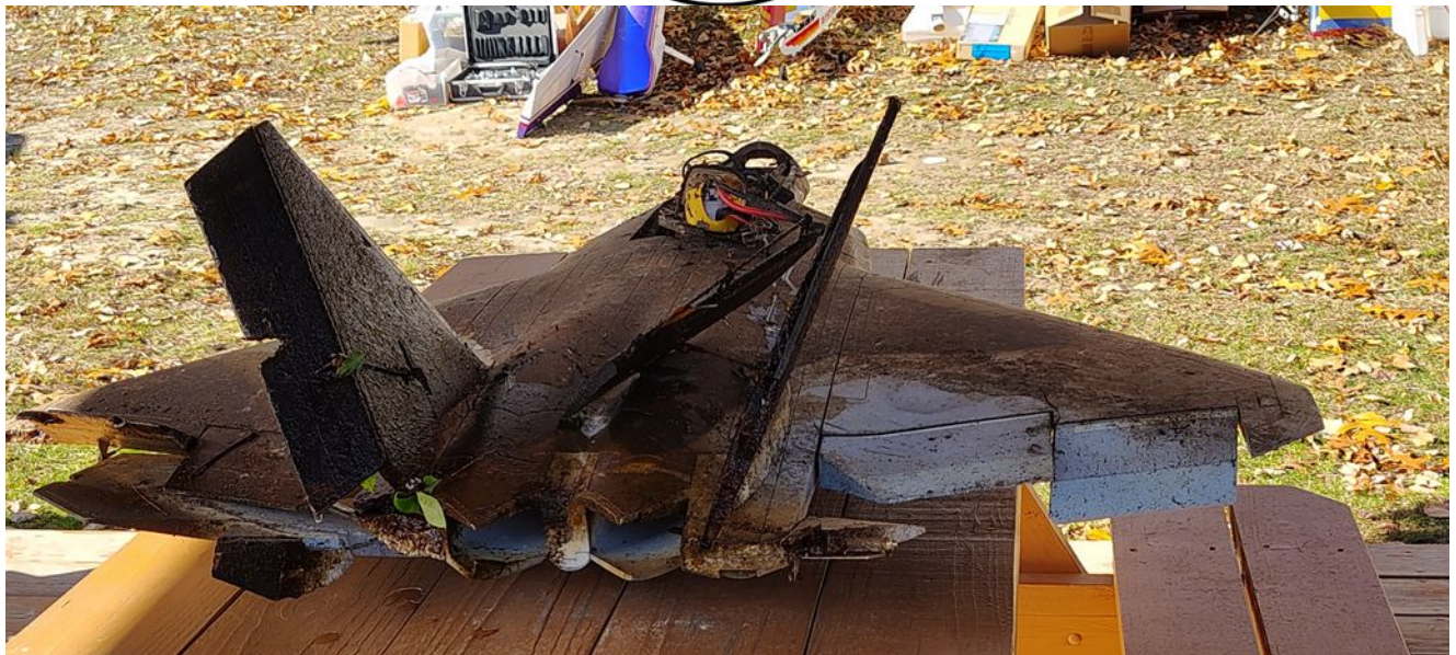
Recovered from the Stream.